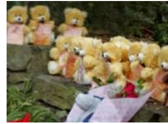
Sandy Hook, 2012

How do we begin? We can start by setting a goal: to save the life of the child who would pick up a gun in anger. If we focus on what to do after the gun enters the picture, it's too late, we have lost the battle.